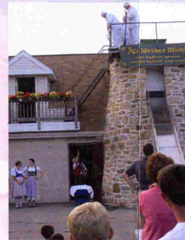
"Alt Weiber Mühle" "The True Fountain of Youth"