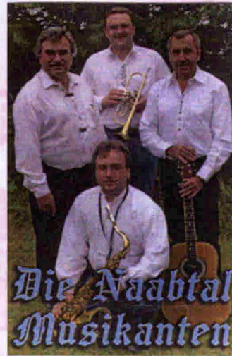
Die Naabtal Musikanten