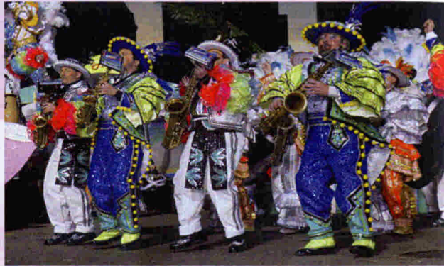
The Greater Kensington String Band

Sauer Braten - Heisser Leberkäse - Kartoffel- Salat - Maultaschen - Spätzle - Bratwurst - Schnitzel Frankfurters - Heisser Zwiebelkuchen - Potato Pancakes - Zwetschgenkuchen and more!!!